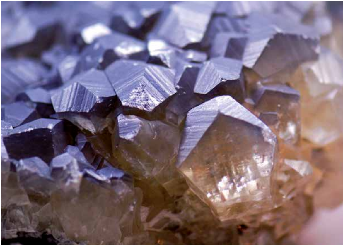
Quartz - base material for the silicate binder „water glass“ or „potassium silicate“